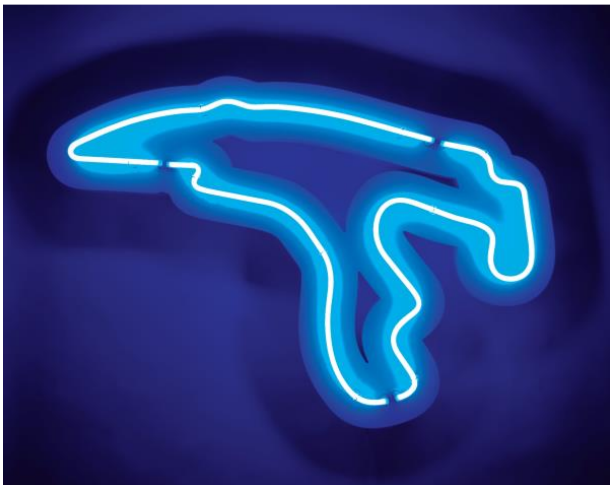
Angela Palmer Circuit de Spa-Francorchamps, Belgium Neon mounted on aluminum, with wall fixtures 72 x 105 x 14 cm Edition of 6 plus 2 artist's proofs £8000 ex VAT