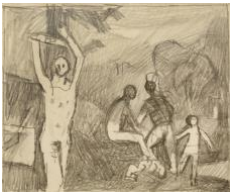
Keith Vaughan 1912-1977 Figures in a wood pencil 8.5 x 11 cm