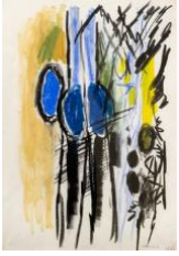
Keith Vaughan 1912-1977