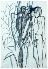
Keith Vaughan 1912-1977