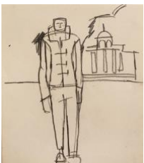
Keith Vaughan 1912-1977 Figure in Iowa, 1959 pencil 16.5 x 15 cm