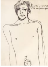
Keith Vaughan 1912-1977 Male Figure, nude, half-length inscribed ' Regarde ! après tout C'est une pauvre affair ' pen and ink 27 x 19.5 cm