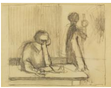
Keith Vaughan 1912-1977