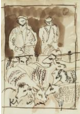
Keith Vaughan 1912-1977 Two Farmers, a sheep and a pen pen and ink 15 x 10 cm 5 7/8 x 4 in