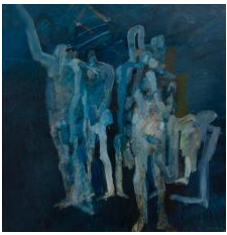
Keith Vaughan 1912-1977 Blue Assembly, 1964 oil on board 63.5 x 61 cm