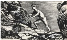
Keith Vaughan 1912-1977 Illustration for "The Spirit of Jem" pen and black ink 11.4 x 19.6 cm