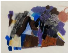
Keith Vaughan 1912-1977