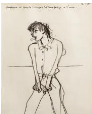
Keith Vaughan 1912-1977 En Passant il Trait La Langue inscribed (upper centre) and with studio stamp (on the reverse) pencil 25 x 18 cm