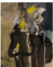
Keith Vaughan 1912-1977