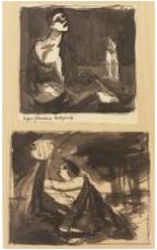
Keith Vaughan 1912-1977 Superflumina Babylonis, c.1960 the first inscribed 'Superflumina Babylonis' (lower left) pen, ink and sepia wash 16 x 16 cm; and 16 x 20 cm (two works framed as one)