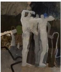
Keith Vaughan 1912-1977 Group of Camel Drivers, 1965 pen, ink, watercolour and pastel 48.5 x 41 cm