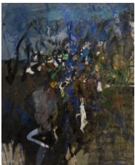
Keith Vaughan 1912-1977