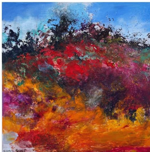
Scilly Heat , 2024, oil on panel, 24.9 x 23 cm £2,400 inc VAT

Zuleika Gallery is delighted to announce Archipelago a solo exhibition of exciting new work by award winning Oxfordshire-based artist Kieran Stiles. From his training at Falmouth School of Art (BA hon Fine Art 1992), Stiles began a life-long love affair with Cornwall and the Scilly Isles, the latter being the inspiration for this exhibition.