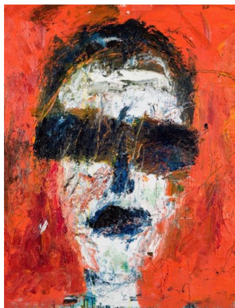
Image left: Frances Aviva Blane, Blue on White , 2024, oil on linen, 183 x 183 cm