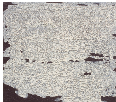
Above: C1-2013 , 2013) oil on canvas 18 x 20 cm 7 1/8 x 7 7/8 in £1440

For Yadegar, the act of creation was very physical. Although some of the works in the exhibition are very small - indeed the paintings at DD47 are exclusively so - many are much larger and these paintings presented a physical as well as intellectual challenge for the slight Yadegar. Of their physicality she wrote, 'The resultant marks and washes echo the physical rhythms of the