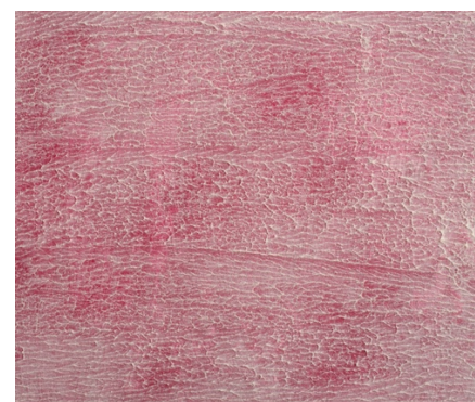
DIFFUSED CARMINE (W13-2014) acrylic on board 30.5 x 36.3 cm 12 1/8 x 14 1/4 in £3180

body. Areas of dark and light take turns in the dominant role. There is a strong element of spatial interweaving, an interplay between figure and ground, a contrasting of soft and hard edge changing the focus from sharp to hazy. They develop observations of the natural world into completely abstract images; memories of places, moments in time, the transition between night and day, dawn to dusk. I would wish the paintings to have a contemplative beauty and to transmit light with a sensation of calm, but strong feeling’.