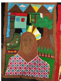
Alice Kettle Pakistan Portrait 2 , 2019 £1,500 Hand and machine stitch on printed fabric With contributions from RLCC (RA'ana Liaquat Craftsman Colony), Behbud and Indus Resource Centre, Pakistan 80 x 46 cm