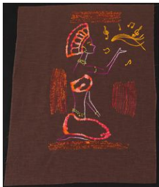
Alice Kettle Singing Lady , 2019 £660 Hand and machine stitch on printed fabric With contributions from Susan Kamara, Uganda 60 x 45 cm