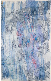
Alice Kettle Sea Figure - Island , 2016 £12,500 Thread on linen 196 x 120 cm (AK032)