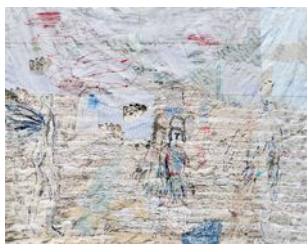
Alice Kettle Paradise Lost , 2010 Thread on Blanket £35,200 230 x 260 cm (AK026)