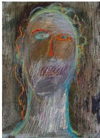
Alice Kettle Portrait of Nel , 2019 £4,500 Hand and machine stitch on printed fabric 84 x 60 cm