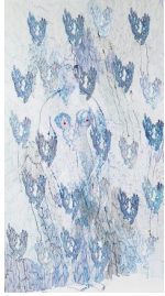
Alice Kettle Suko , 2011 £12,500 Thread on Linen 218 x 120 cm (AK029)