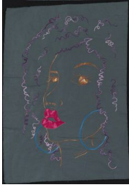
Alice Kettle Portrait , 2019 £300 Hand and machine stitch on printed fabric. With contributions from Monica, Iran 60 x 42 cm