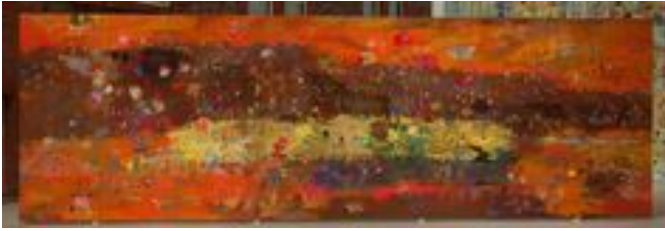
Alice Kettle Ground, 2018 £45,000 Embroidery, Thread on printed canvas 300 x 800 cm (AK040)