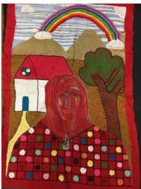
Alice Kettle Pakistan Portrait , 2019 £1,500 Hand and machine stitch on printed fabric With contributions from RLCC (RA'ana Liaquat Craftsman Colony), Behbud and Indus Resource Centre, Pakistan 80 x 46 cm