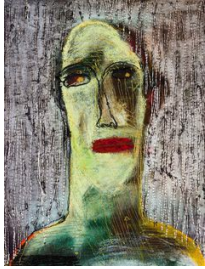
Alice Kettle Portrait of Mouti , 2019 £2,200 Hand and machine stitch on printed fabric 38 x 28 cm