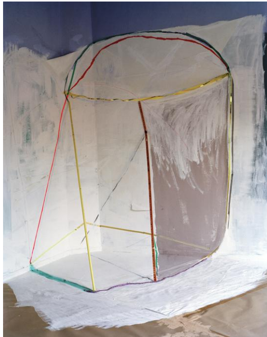
Above: 15:03, August 2, Thursday, 2012